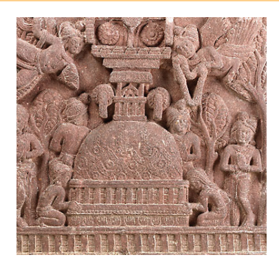
Stupa worship, Bharhut