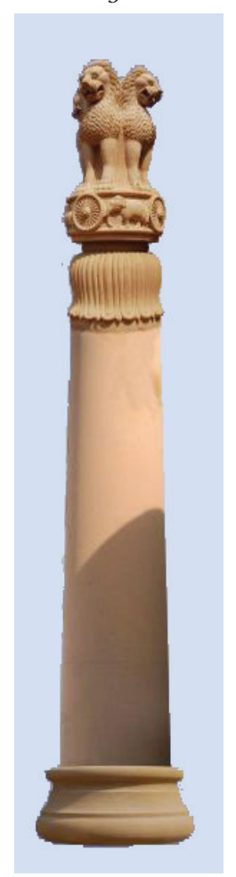
Pillar capital and abacus with stylised lotus

Construction of stupas and viharas as part of monastic establishments became part of the Buddhist tradition. However, in this period, apart from stupas and viharas, stone pillars, rock-cut caves and monumental figure sculptures were carved at several places. The tradition of constructing pillars is very old and it may be observed that erection of pillars was prevalent in the Achamenian empire as well. But the Mauryan pillars are different from the Achamenian pillars. The Mauryan pillars are rockcut pillars thus displaying the carver's skills, whereas the Achamenian pillars are constructed in pieces by a mason. Stone pillars were erected by Ashoka, which have been found in the north Indian part of the Mauryan Empire with inscriptions engraved on them. The top portion of the pillar was carved with capital figures like the bull, the lion, the elephant, etc. All the capital figures are vigorous